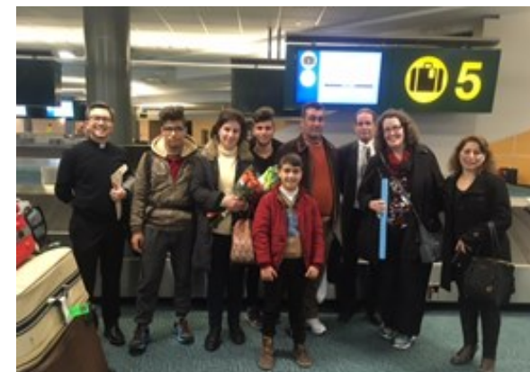
Arrived at Vancouver Airport on Thursday, February 8th