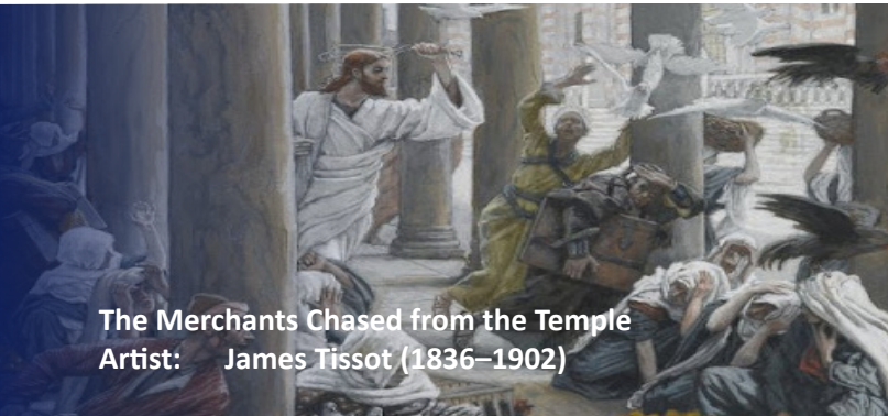
The Merchants Chased from the Temple Artist: James Tissot (1836-1902)