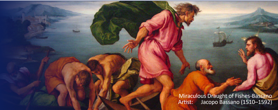
Miraculous Draught of Fishes-Bassano Artist: Jacopo Bassano (1510-1592)